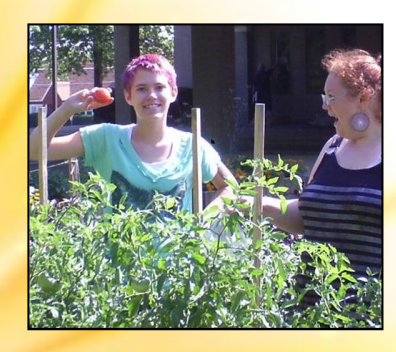
47 Teens grew food at our Youth Community Gardens