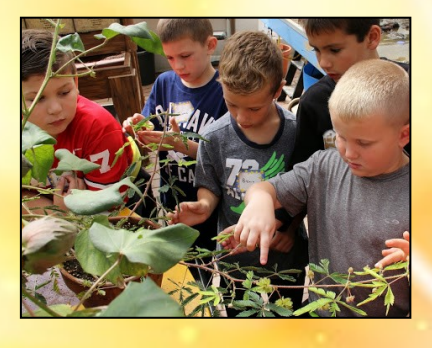
1,700 School students were taught Environmental science and inspired to help Conserve & Preserve