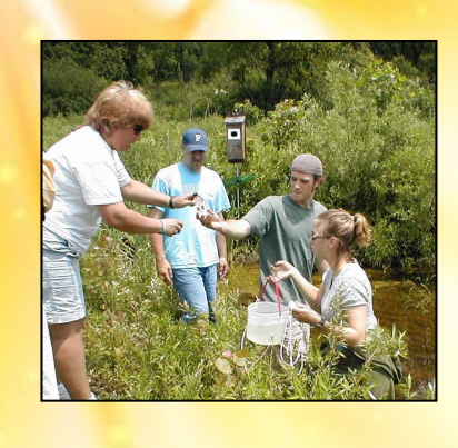
3,180 People had fun learning about Nature at Spooky Science