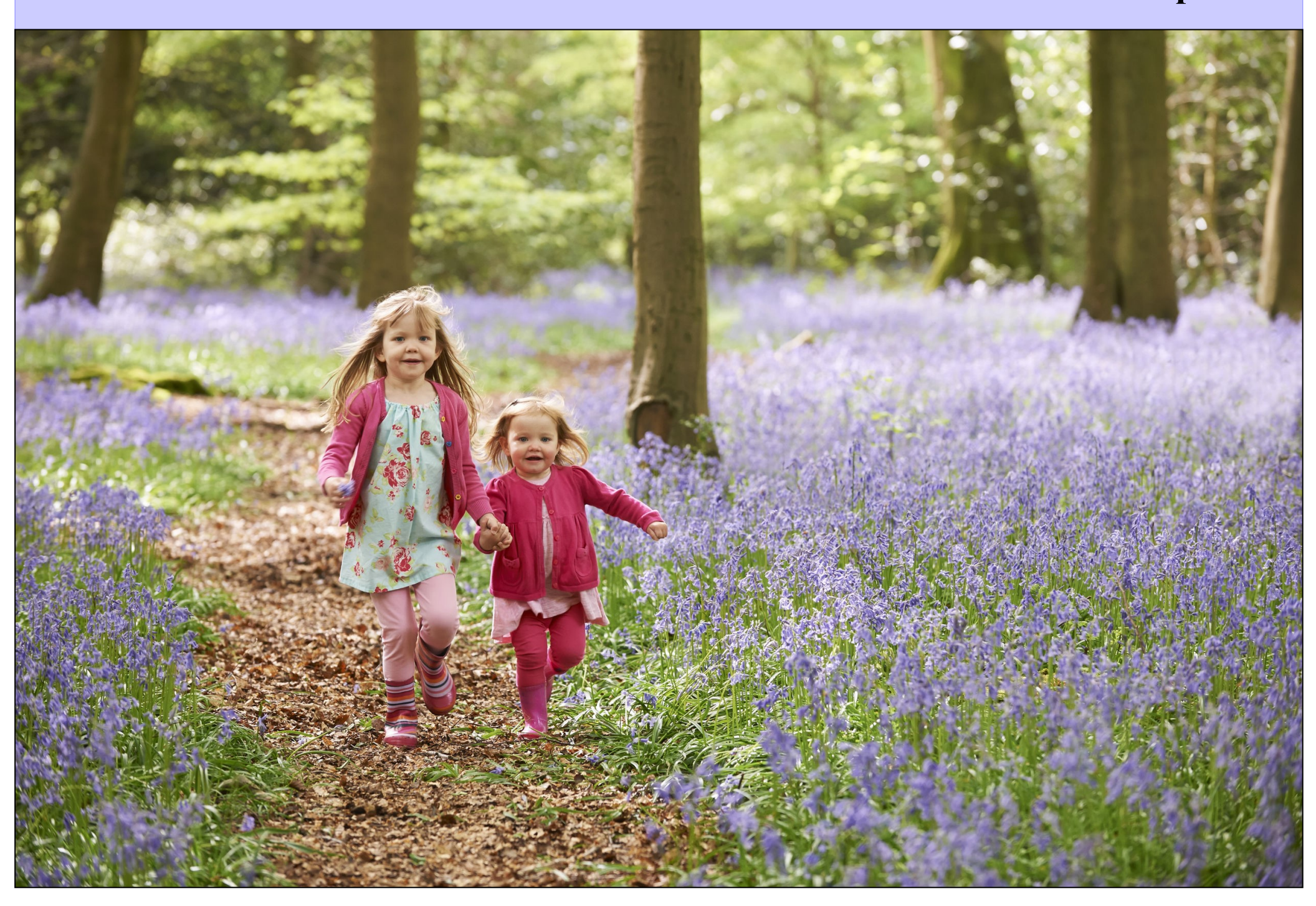
2018 Annual Report