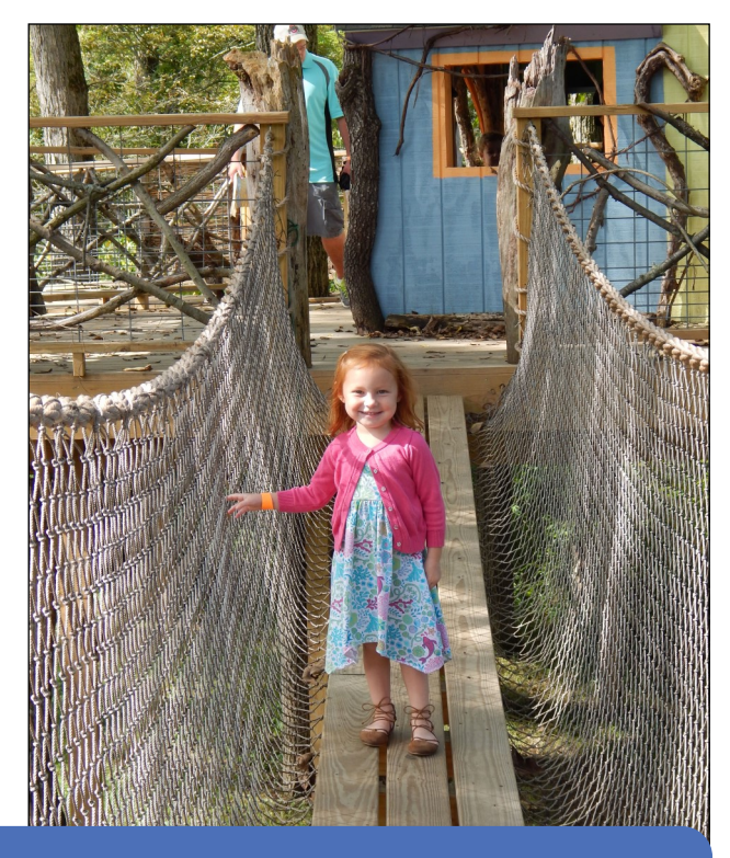
~ Thank You ~

To The Hoover Foundation & Numerous Volunteers, Staff & Anonymous Donors For making the new nature playground "Nature Playce" a reality.